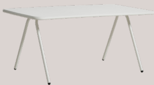
DINING TABLE 160