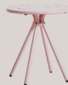
CAFÉ TABLE ROUND