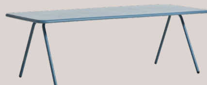
DINING TABLE 220