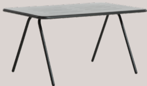
DINING TABLE 140