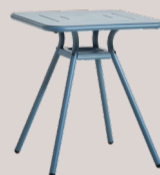
CAFÉ TABLE SQUARE